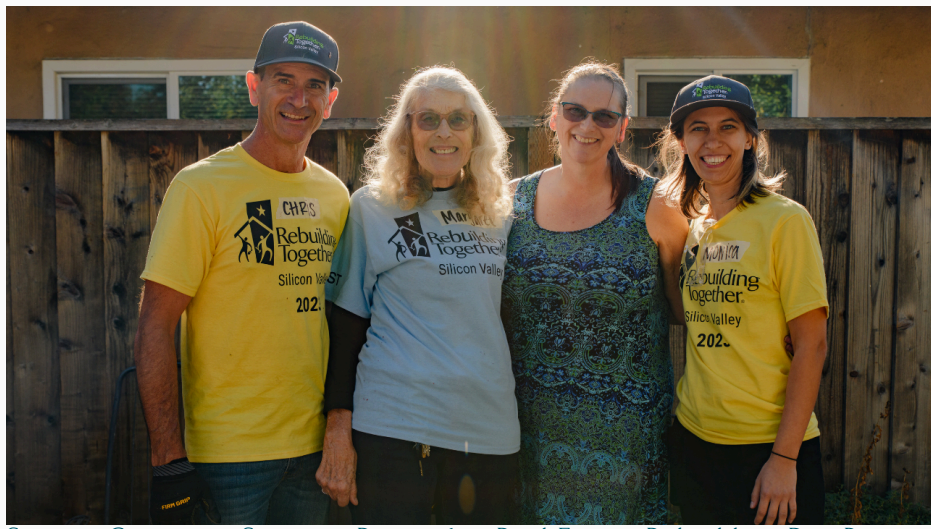
Source: Corporate Sponsor, Rainmaker Real Estate, Rebuilding Day Project

PROCEEDS FROM THE EVENING WILL RAISE MUCH-NEEDED RESOURCES FOR OUR HOME SAFETY REPAIR PROGRAM BENEFITING LOW-INCOME OLDER ADULTS, PEOPLE WITH DISABILITIES, VETERANS, AND FAMILIES WITH YOUNG CHILDREN. WITH YOUR HELP, WE WILL RAISE MONEY, CELEBRATE OUR WORK, AND HAVE AN EVENING TO REMEMBER!