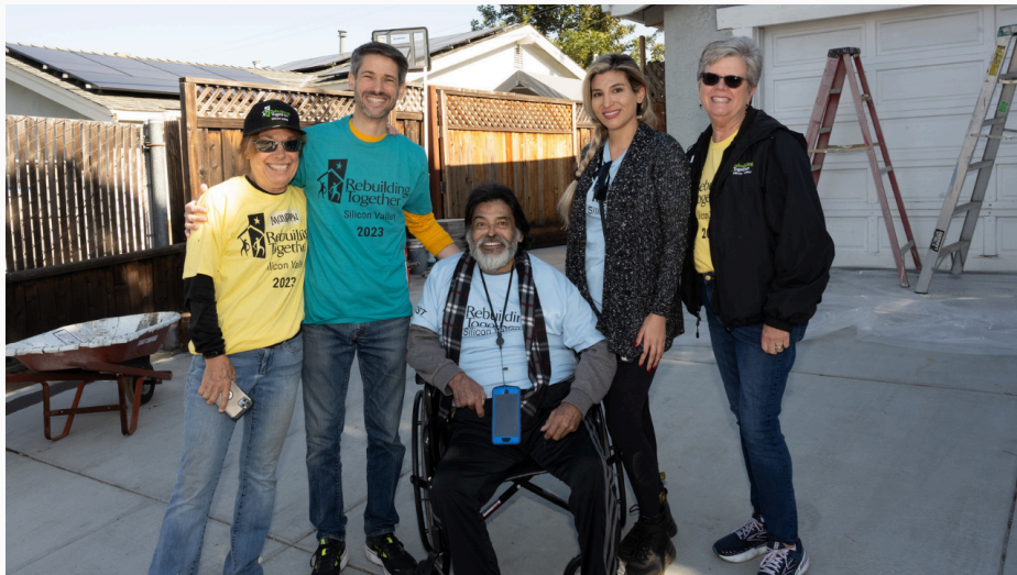
Client on Rebuilding Day

Housing stability, quality, safety, and affordability all affect our neighbor's potential health outcomes. In addition, a neighborhood's physical and social characteristics affect health outcomes as well.