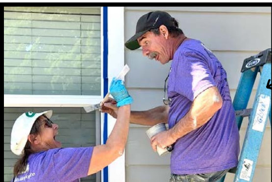
Volunteers from Cupertino Rotary have some fun while revitalizing this home.